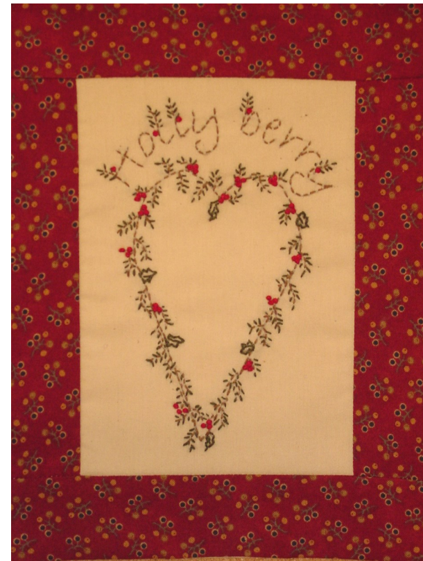
Holly berry Stitchery All stitches use two strands of floss