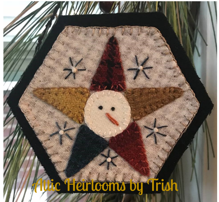
2018 July Ornament