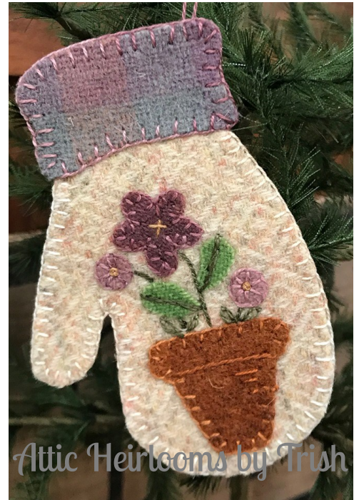
2019 June Ornament